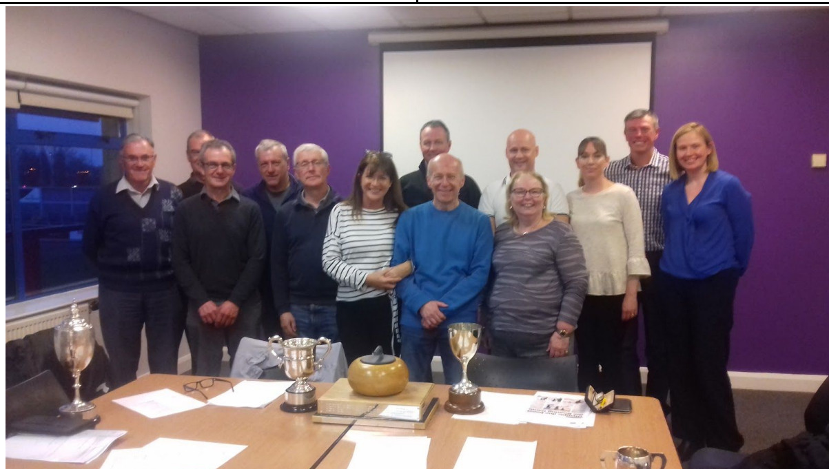
Attendees with the Cairns/Elder, SCCA League and Dunn trophies.